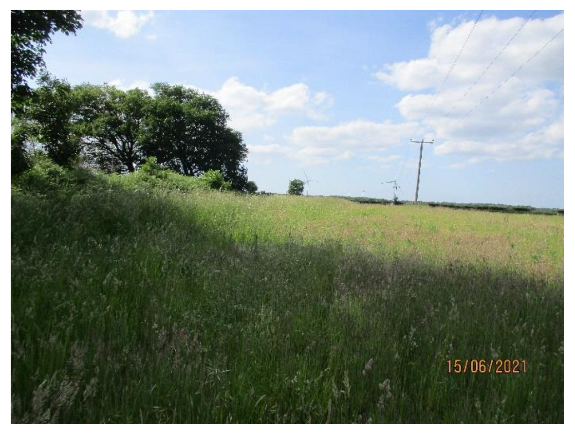
26: Grassland strip along Breck Road at G14