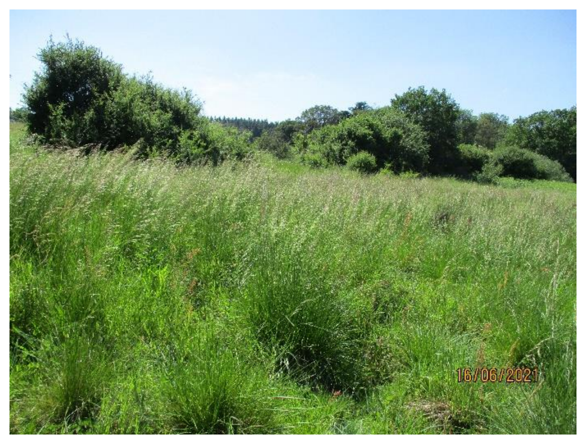
18: Tufted hairgrass-dominated area at Grassland G8