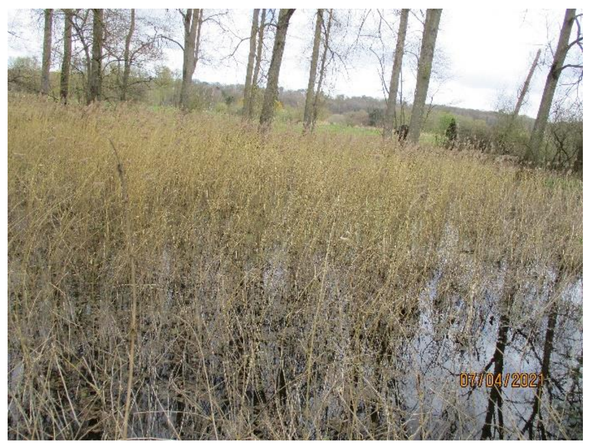
43: Wet woodland at Rose Carr