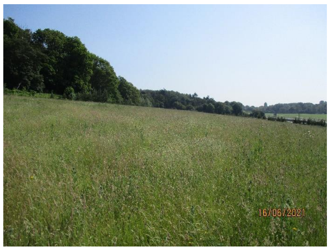
2: Grassland across field at G2