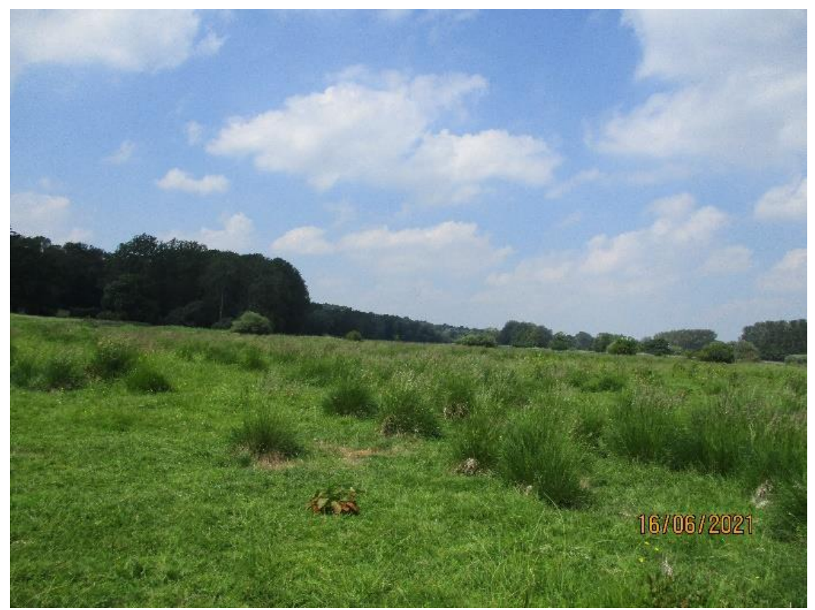
15: Tufted hairgrass-dominated area at Grassland G7