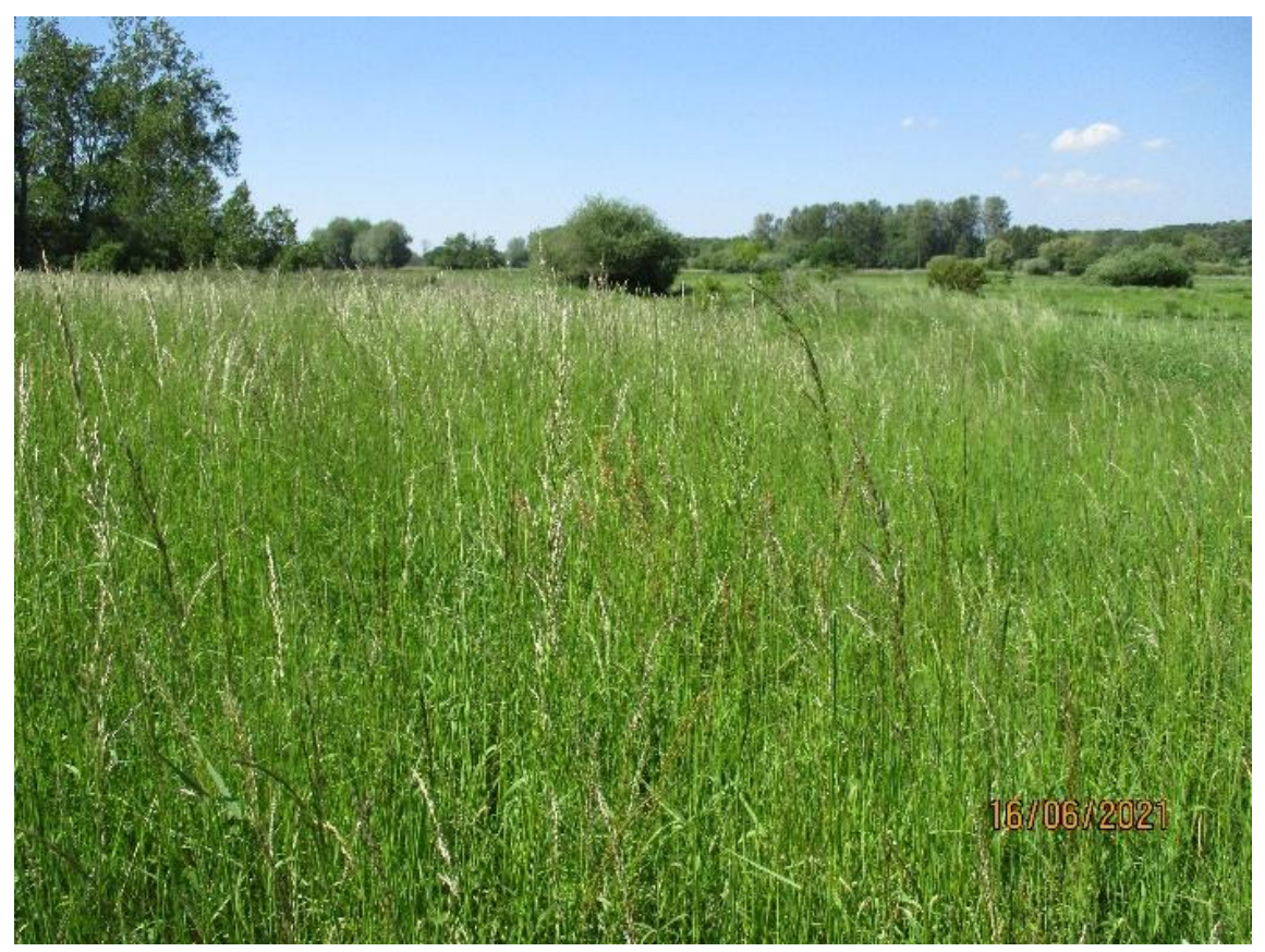
17: False oat-grass-dominated area at Grassland G8