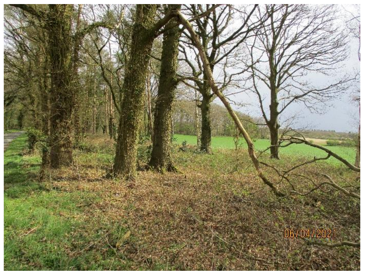
59: Mixed woodland along southern edge of The Broadway Woodland (W7)