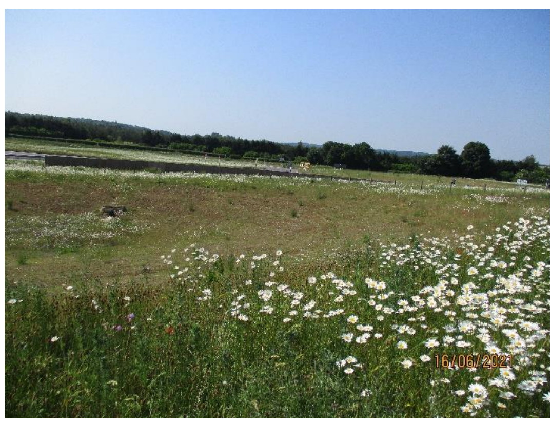
1: Grassland at G1 around attenuation pond