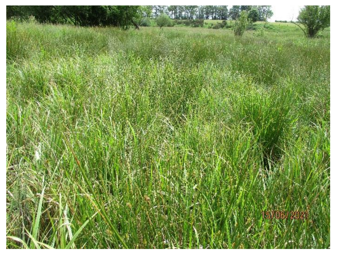
34: Stand of greater pond sedge at Grassland G16

33: Grass-dominated vegetation at Grassland G16