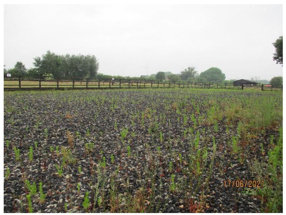
25: Artificial surface at Grassland G13