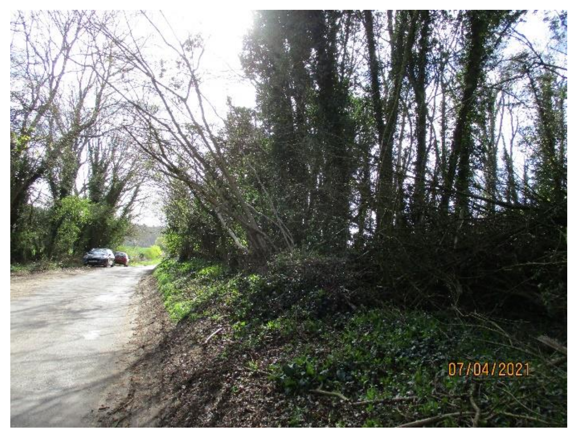
54: Trees to south of Ringland Lane Woodland (W5)

53: Trees to north of Ringland Lane Woodland (W5)