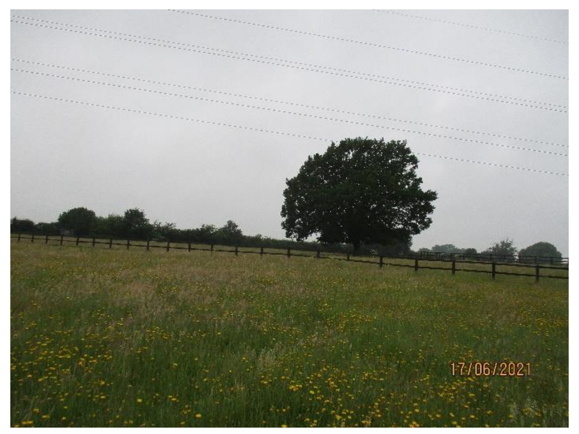
24: Horse paddocks at G13 grassland

Norwich Western Link Road Project No.: 70061370 | Our Ref No.: 70061370-09-30 Norfolk County Council