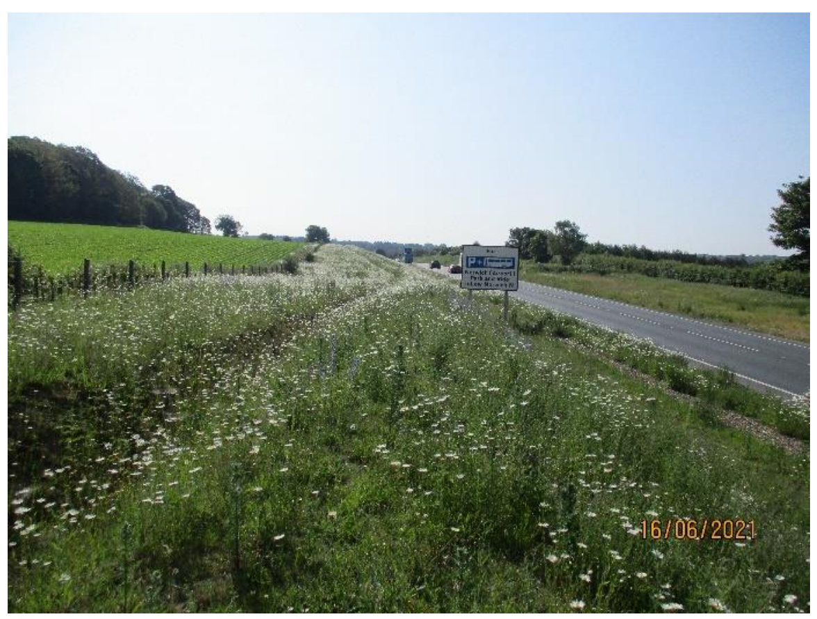
4: Grassland along verge at G3

3: Nettle-dominated section of verge at Grassland G3