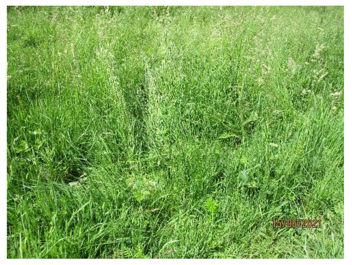
32: Rush-dominated vegetation at Grassland G16

31: Stream at Foxburrow Meadow Grassland G16