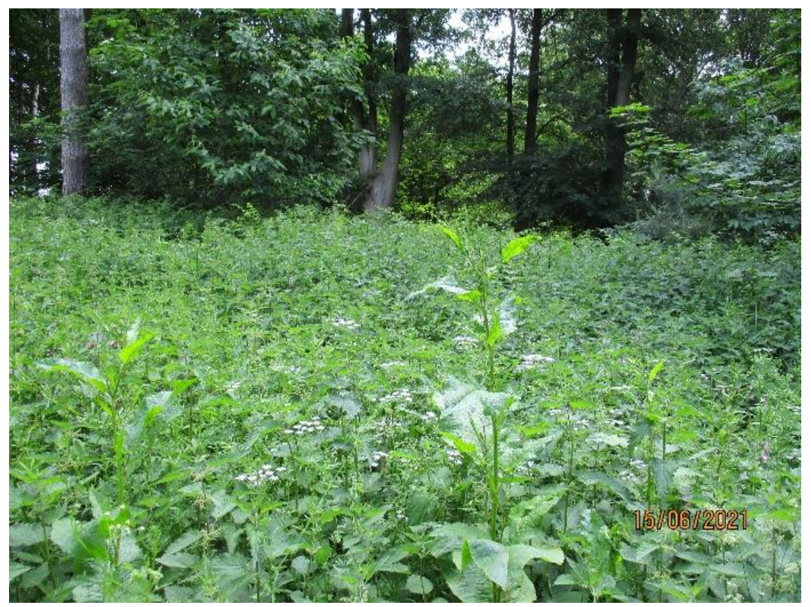
29: Southern section of central glade at Grassland G15