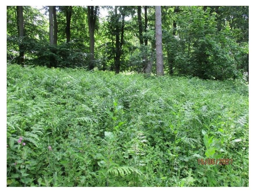
28: Western edge of central glade with bracken

27: Central woodland glade at Grassland G15