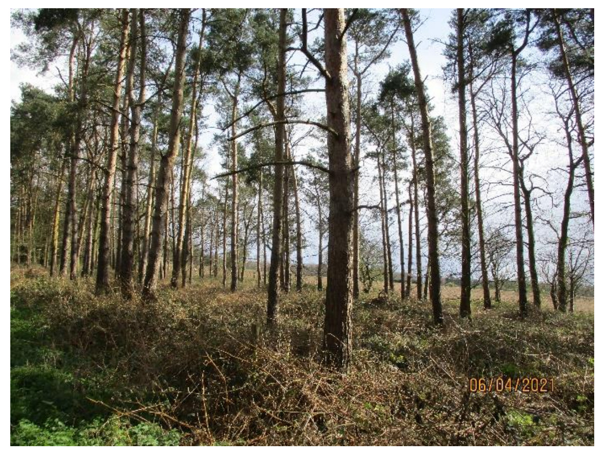
60: Eastern end of southern edge of The Broadway Woodland (W7) with Scots pine plantation