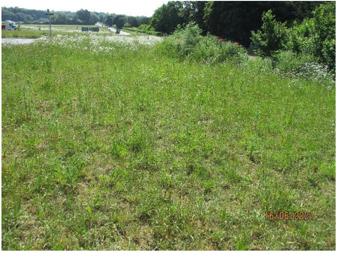
6: Grassland along verge at G4

5: Unopened flower spike of hoary mullein at Grassland G3