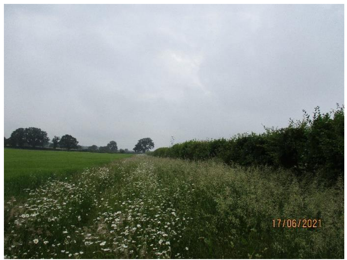
23: Species-richer grassland at southern end of Grassland G12